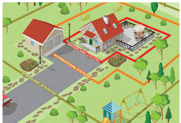
Rake and remove pine needles and dry leaves to a minimum of 3 to 5 feet from a home.