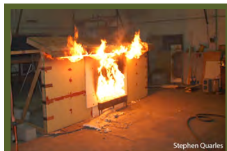
Flame impingement exposure to the underside of the eave, and time-to-ignition of the joists, blocking and fascia was quicker; and lateral flame spread faster, when an open-eave design was used in research experiments.